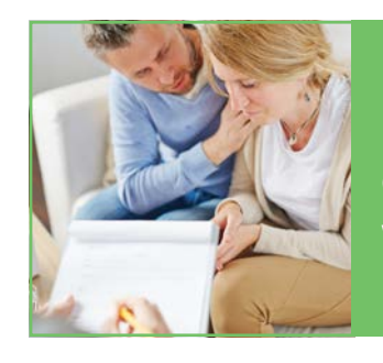
Life Smart Coaching can help you cope with your grief and loss.

Life Smart Coaching services are offered over the telephone. If you ever feel uncertain or overwhelmed, about any issue, we can also arrange counselling. Counselling services can be offered face-to-face, over the phone, through video, or online.